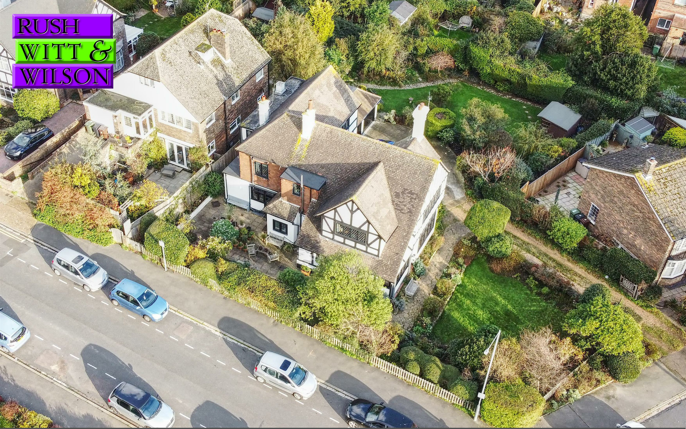
Flat 2, Tudor Cottage, 38 Manor Road, Bexhill-On-Sea, East Sussex TN40 1SN £355,000